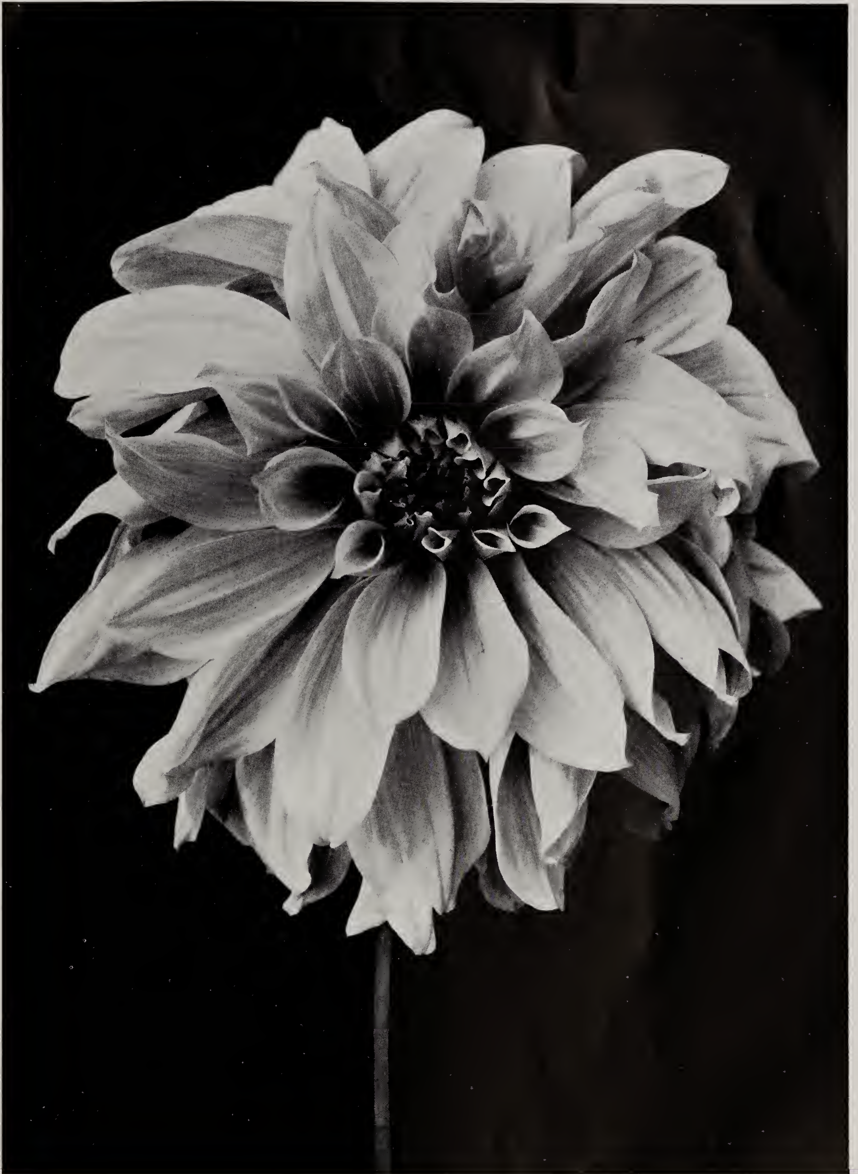
ARTHUR M. HYDE